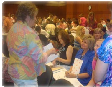
Participants connecting as part of the networking activity.