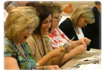
Participants creating communication books during "Picture Exchange in Action" presentation.

"Great Job!!" "Keep up the great conference." "The keynote was great and so was all the presentations." "The LATI group is the most creative and congenial group of educators to grace the system."