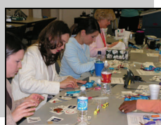
Make-N-Take Textured Playground Lanyards