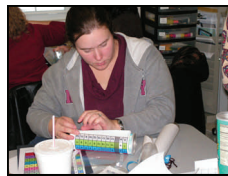
Make-N-Take Math Wheels