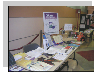
AT @ A Glance Nicholls Disability Awareness Day

Nicholls' Disability Awareness Day and the LACUE Conference in Baton Rouge. We provided an AT Overview for all 504 Coordinators at the DOE. We assisted the AT Teams in Ascension and St. Mary in conducting AT assessments. We assisted Ascension, Assumption and St. Mary in the development of their district's policies and procedures for AT. We conducted an AT Tools for Students with Disabilities training in Terrebonne and conducted several trainings in Lafourche: Low tech Tools for Reading and Writing, Classroom Suite and an AlphaSmart Overview.