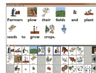
PixWriter/Writing with Symbols