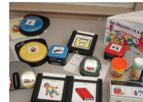
Tools for Communication