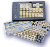
Intellikeys & Overlay Maker 3

To request a training for your school/parish/organization or have any questions, please contact our center at 225-621-2538.