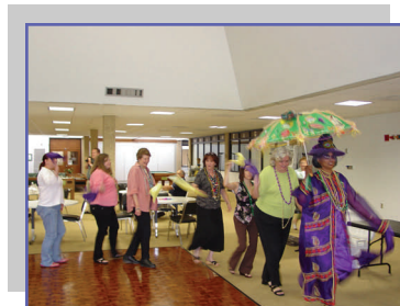
We even had time for a little fun doing the second line!!!!