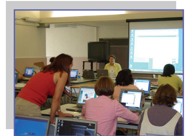
Participants working hard in the reading stand.